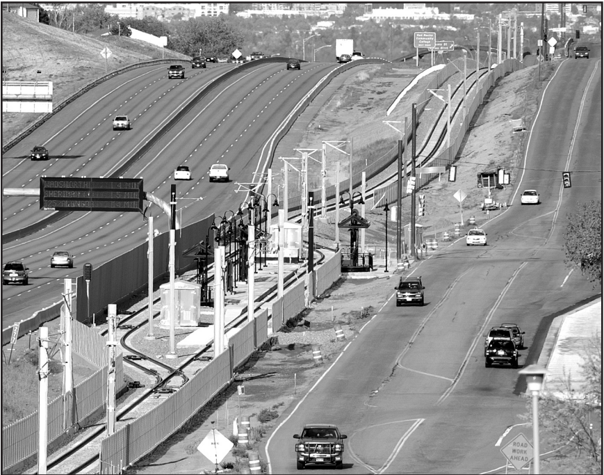
The new RTD West Corridor station along Highway 6 at Red Rocks Community College in Lakewood, Colorado, on May 23, 2011.

project in North America first hand. Participation is limited to 25 people per tour. To reserve your spot, visit: www.denverunionstation.org .