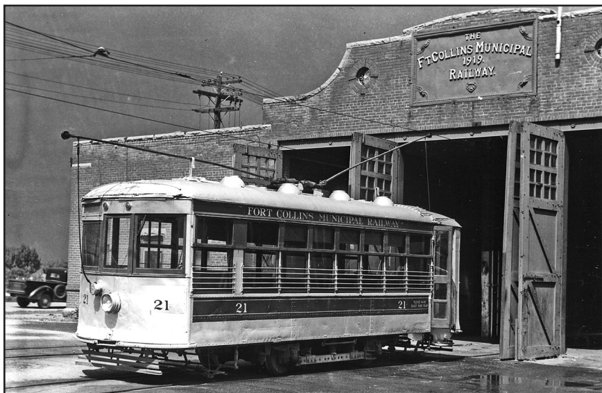
The Ft. Collins Municipal Railway #21 is parked in front of the Railway's car barn under a dark afternoon sky. The date is unknown.