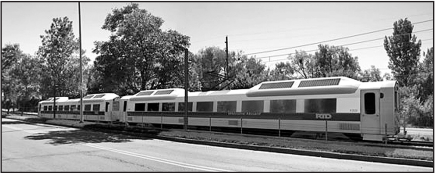
Simulation of the RTD EMU along Grandview Avenue in Arvada. – Rendering Courtesy of RTD.

Both lines will start and end at Denver Union Station (DUS). On our airborne journey we will see the challenge of adding new rail lines in and out of DUS. The East Corridor threads its way out of DUS and soon parallels the Union Pacific along Smith Road, flies over I-70, and follows Pena Boulevard to end at a new rail station-hotel-terminal expansion at DIA. The future Gold Line roughly parallels the BNSF tracks out of DUS, crosses over the Jersey Cutoff, to the Utah Junction area, and then proceeds west along the UP tracks to C&S Junction, then along the BNSF tracks (Colorado Central) to Ward Road in Wheat Ridge.