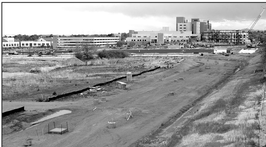
The Federal Center station where buses will soon connect with light rail, as seen on May 23, 2011 – Photo © 2011 Dave Schaaf.