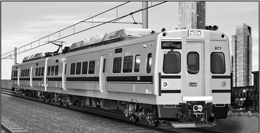
Another possible design for the RTD EAGLE P3 EMU.