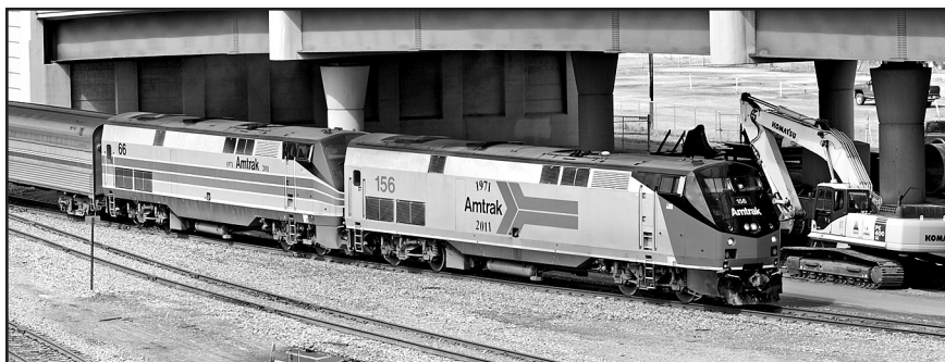
The westbound California Zephyr with two commemorative Amtrak units leave Denver on May 20, 2011.

it. In 2008, the state had agreed to buy 180+ miles of track from Lamy to the Colorado border for future passenger use. In the meantime, BNSF has moved its freight to other routes, and only two Amtrak trains run each day. The governor wants money back from the railroad, but this will likely be a long story.