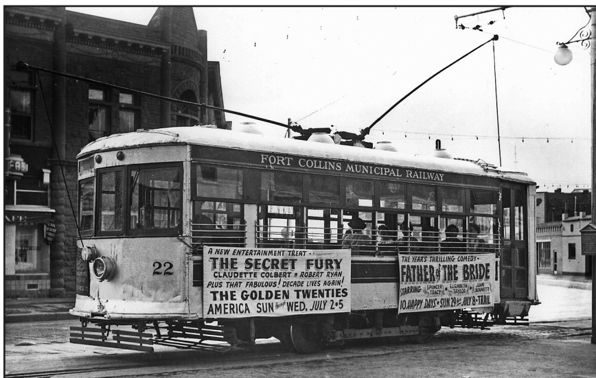
On July 4, 1950, Ft. Collins Municipal Railway, Birney #22, is plying the streets of Ft. Collins, Colorado. This car was eventually acquired by the Rocky Mountain Railroad Club and was on display at the Colorado Railroad Museum for many years.